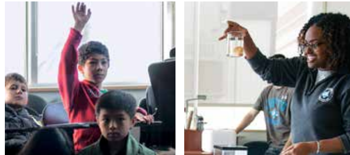
Tufts undergraduate and graduate students love to spark Science, Technology, Engineering, and Math (STEM) education excitement for kids through hands-on community programming in schools and at campus events.

share their passion and excitement with high school students in local schools. They spark students' curiosity through hands-on activities and inspire young women, people of color, and first-generation college-bound students to consider a STEM path for themselves.