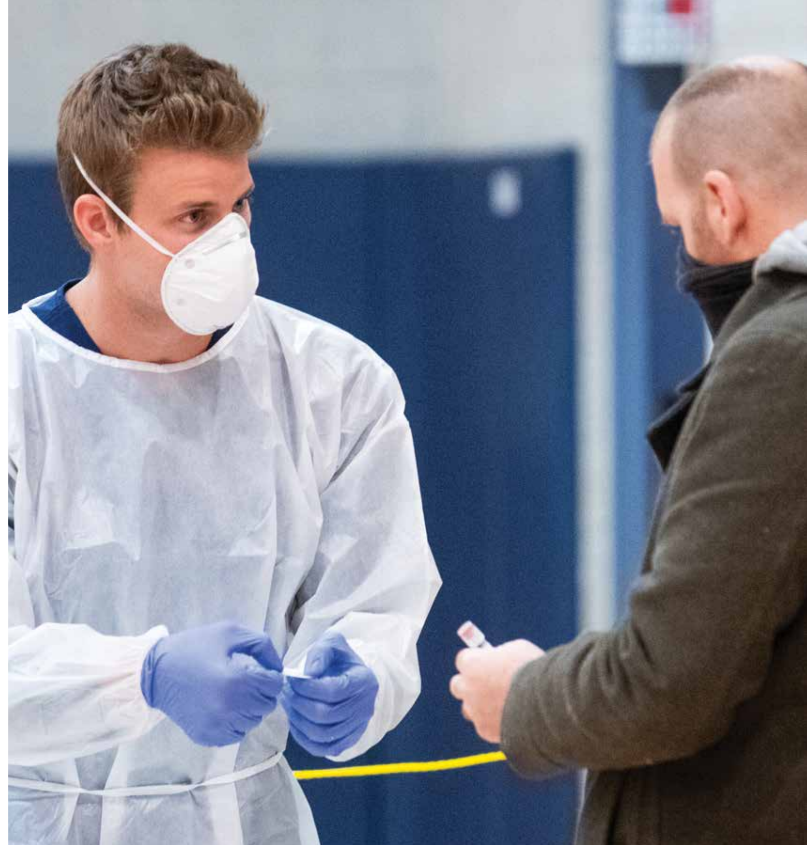
A Somerville Public School teacher visits the Albert F. Argenziano School for COVID testing. Tufts partnered with Medford and Somerville to create one of the state’s first public school pooled testing programs.