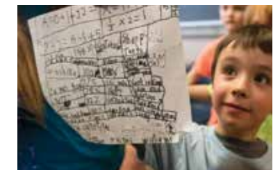
above: Young people in nearby communities know Tufts well because so many of our students volunteer with youth-serving organizations and campus community programs like Kids’ Day, Traveling Treasure Trunk, DREAM, Best Buddies, and Big Brothers, Big Sisters. Through the Leonard Carmichael Society alone, more than 1,000 undergraduates serve more than 30 nonprofit organizations annually.